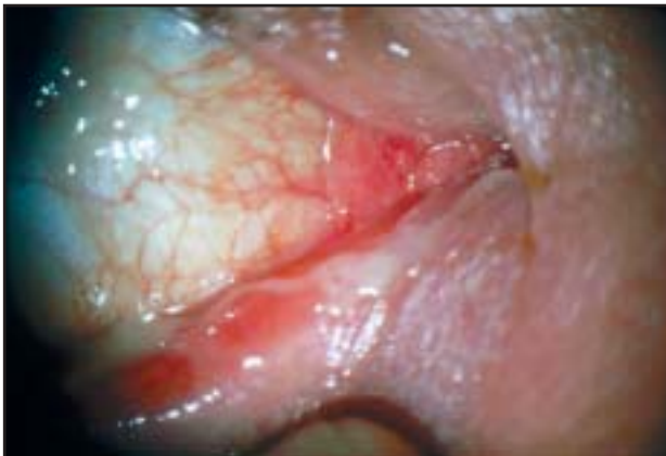
Fig. 3 Palpation of the right lacrimal sac expresses a mucoid discharge from the inferior punctae