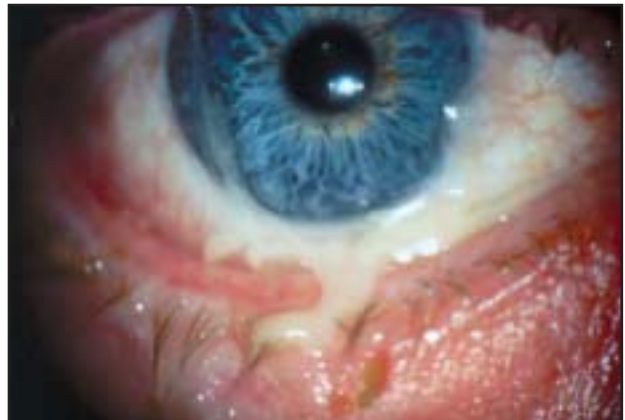
Fig. 4 A moderate mucoid discharge collects on the right lower lid following expression from the lacrimal sac

aggressive, obtaining culture and sensitivity testing and the systemic antibiotic should be continued for 10 to 14 days. One should not wait for the culture results to begin treatment, as there can be a 3- to 4-day delay in obtaining results.